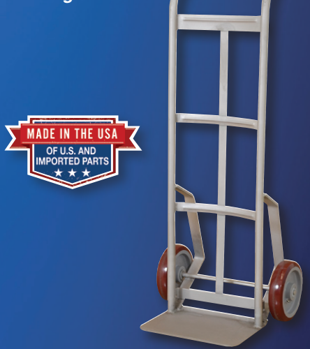
Hand Truck Part #210351 / Model #156-PP8-SS