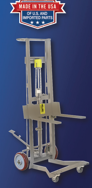
4-Wheeled Pedalift Part #260197 Model #SSDPL-54-F