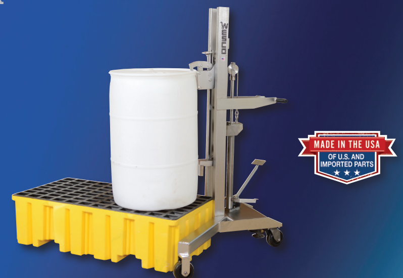
Drum Handler Part #240240 / Model #SSDH