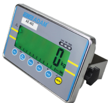
AE 402 Indicator